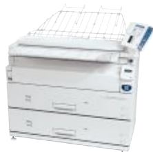
WIDE-FORMAT MONOCHROME AND COLOR