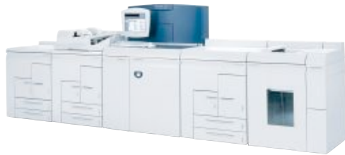
PRODUCTION MONOCHROME AND HIGHLIGHT COLOR